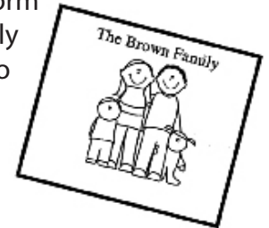
Peace Wall Tile Order Form

Please make sure to complete the order form below with your family name as you wish it to appear on the tile.