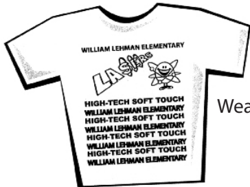
Teal "Laser" T-shirt