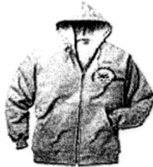
Unisex Zippered Hooded Sweatshirt